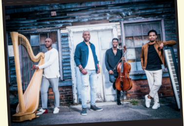
Sons of Serendip