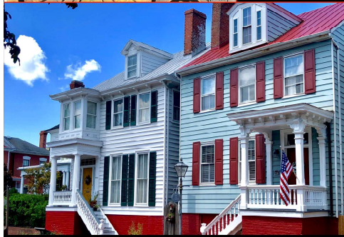
HISTORIC OLDE TOWNE PORTSMOUTH