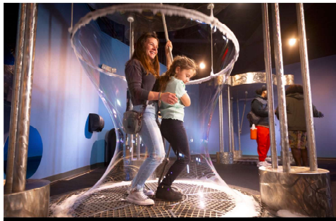
THE CHILDREN'S MUSEUM OF VIRGINIA